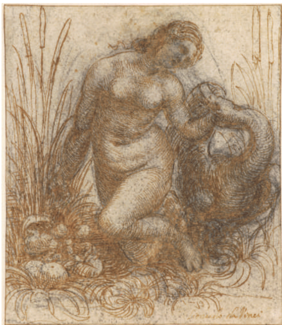
4. Leonardo da Vinci (1452-1519) Leda and the Swan , c. 1505-07 Black chalk, pen and ink. – 128 x 109 mm Museum Boijmans Van Beuningen, Rotterdam. Loan Stichting Museum Boijmans Van Beuningen (former Koenigs Collection), inv. no. I 466