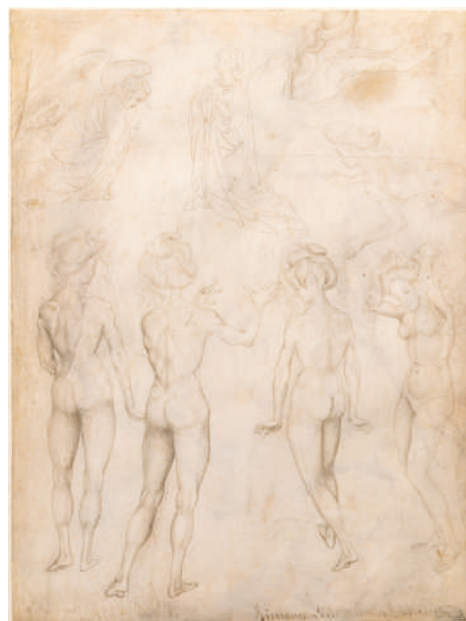
1. Pisanello (c. 1395-1455) Four Studies of a Female Nude, an Annunciation and Two Studies of Women Swimming , c. 1431-32 Pen and ink on parchment. – 223 x 167 mm Museum Boijmans Van Beuningen, Rotterdam. Loan Stichting Museum Boijmans Van Beuningen (former Koenigs Collection), inv. no. I 520

Drawings by the three great masters of the Renaissance – Leonardo da Vinci (fig. 4), Raphael and Michelangelo – constitute another high point in the exhibition and lead us on to the work of Roman artists (Giulio Romano, Sebastiano del Piombo), those from Parma and Emilia (Parmigianino, Correggio) and other regional schools. The exhibition