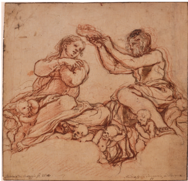
11. Correggio (1489-1534) Study for the Coronation of the Virgin , c. 1520-22 Red chalk, pen, brush and ink. – 196 x 203 mm Museum Boijmans Van Beuningen, Rotterdam. Loan Stichting Museum Boijmans Van Beuningen (former Koenigs Collection), inv. no. I 381

A MONG THE LARGE VARIETY of collections held by Museum Boijmans Van Beuningen in Rotterdam can be found one of the most noteworthy holdings of Old Master Drawings in the world. Eager to introduce this prestigious collection to a wider public, the Fondation Custodia is proud to present a selection of 120 of the finest fifteenth- and sixteenth-century Italian drawings from the Rotterdam museum.