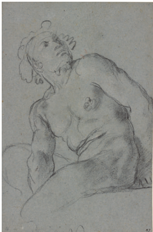
14. Annibale Carracci (1560-1609) Study of a Seated Male Nude , c. 1595-1600 Black chalk, heightened with white, on blue paper. – 336 x 221 mm Museum Boijmans Van Beuningen, Rotterdam. Loan Stichting Museum Boijmans Van Beuningen (former Koenigs Collection), inv. no. I 183

ends with drawings by the generation of artists active at the end of the sixteenth century and the turn of the seventeenth, including Federico Barocci (fig. 13), the Zuccari, Cavaliere d'Arpino and the Carracci (fig. 4).